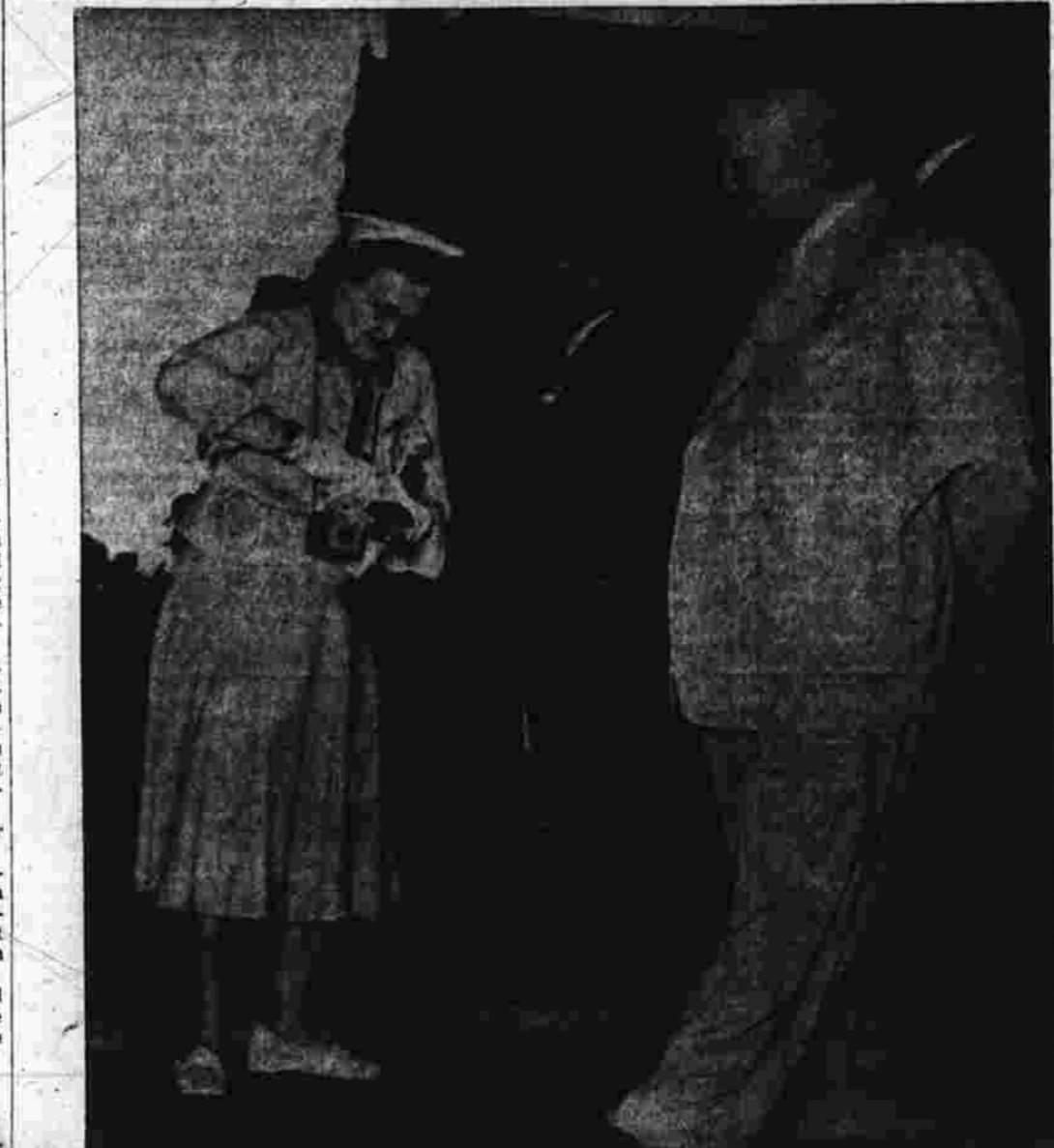
Women included in Premier Khrushchev's San Francisco hustles to wind up her camera as Soviet Premier Nikita Khrushchev as the visiting Russian leader left his Mark Hopkins hotel suite for a stroll today.